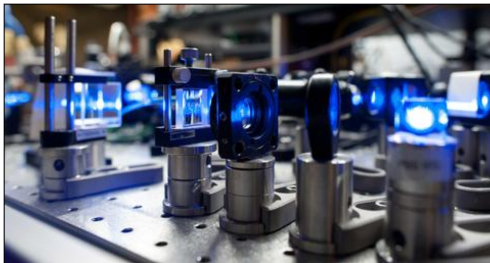
Blue laser light traveling through lenses and other optical components in JILA's experiments on light scattering in an ultracold gas of strontium atoms.

The researchers used blue light to excite atoms in the Fermi sea and then measured the resulting photon radiation along different directions. By setting up specific conditions, the team reduced